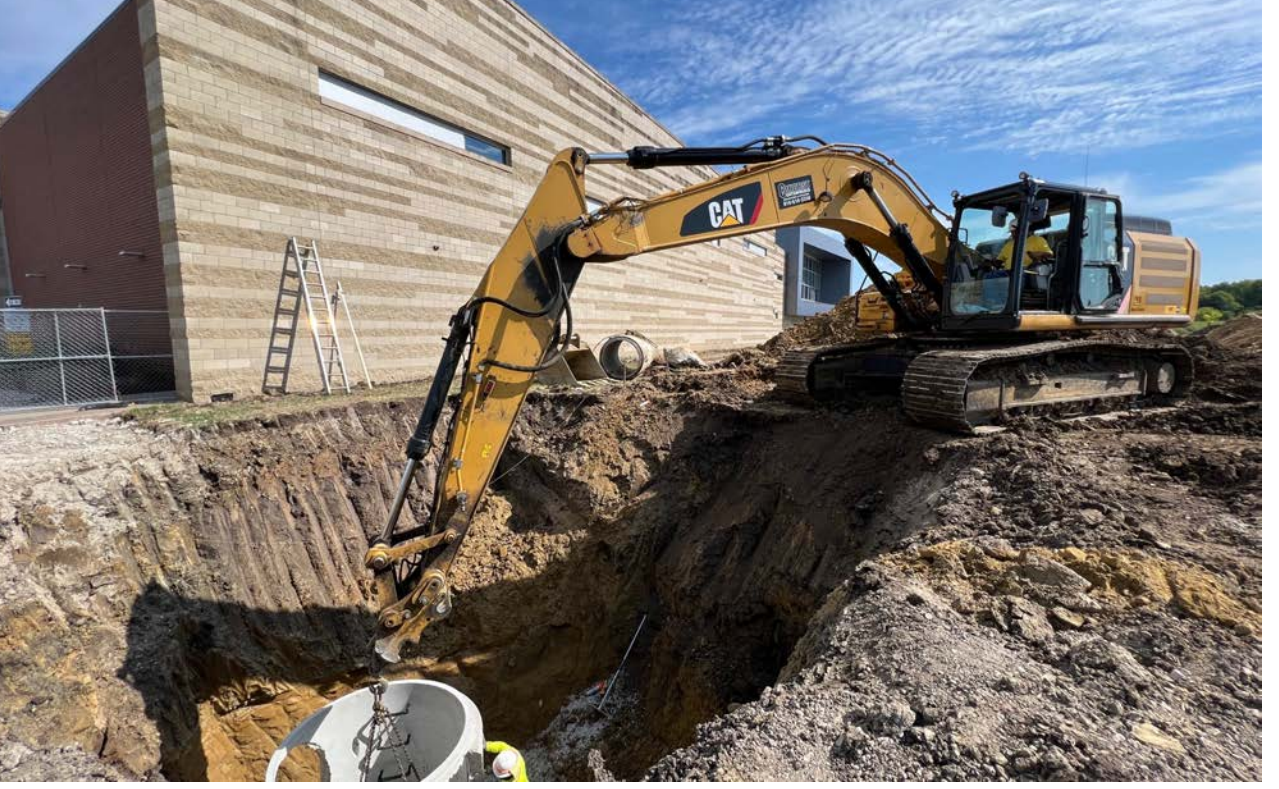
Scope: Multipurpose addition at Aubry Bend Middle School.

Currently kicking off the following projects: